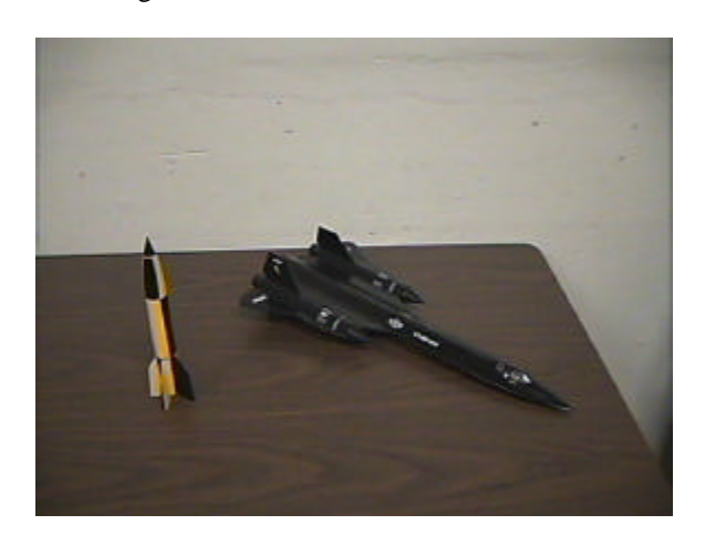
[See also cover photo -JL]