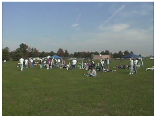
15 October 2000 - a good day to fly!