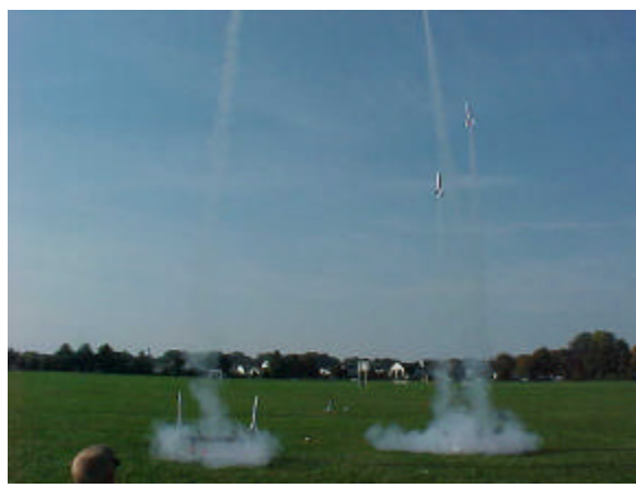
Our monthly Silver Comet Drag Race, October 15

Well, that's all the flying that's fit to print. Faithfully submitted – Art