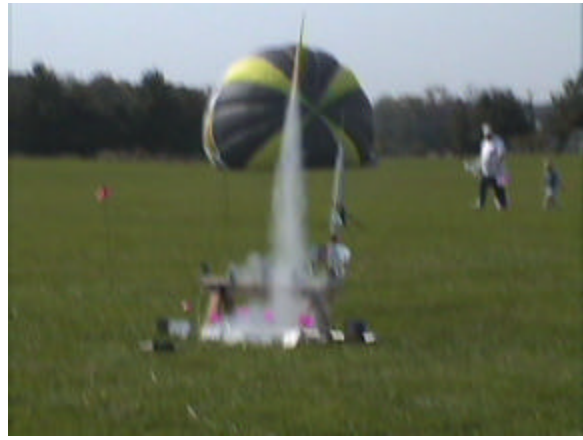
Local fireman pressure test a hot-air balloon while we fill the sky with our rockets