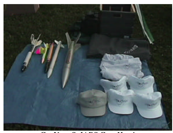
Get Your SoJARS Gear Here! Hats & Ts still available