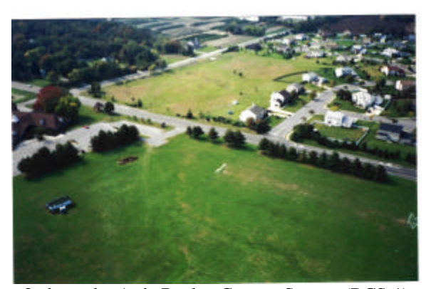
2 photos