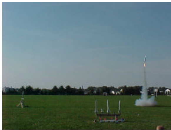
A mid-powered rocket lifts-off from one away cell while another stands ready to the left... and 3 Silver Comets await a drag race on the rack