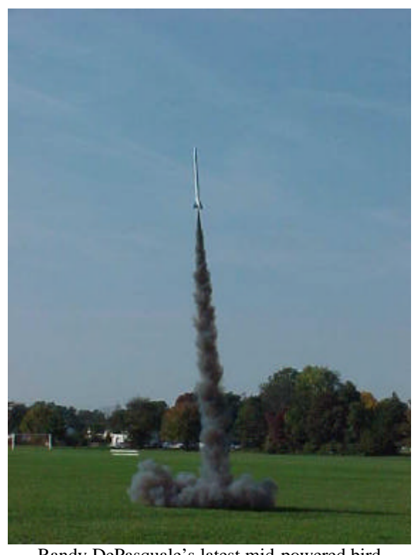
Randy DePasquale's latest mid-powered bird