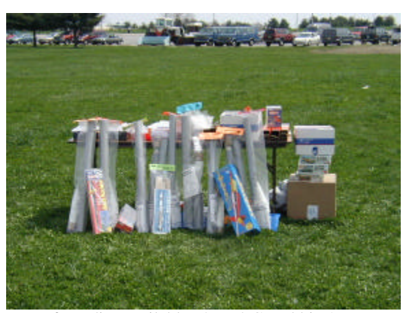
Lots of goodies available c/o M&G Hobbies!