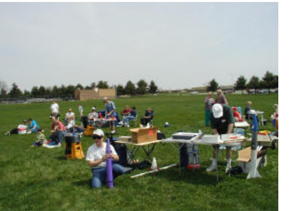
A Great Turn-Out on a Perfect Spring Day

the listserver will be up to speed. Let's see how it works out.