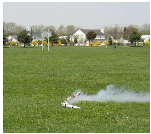
Pat's Saturn V sizzles on the ground!