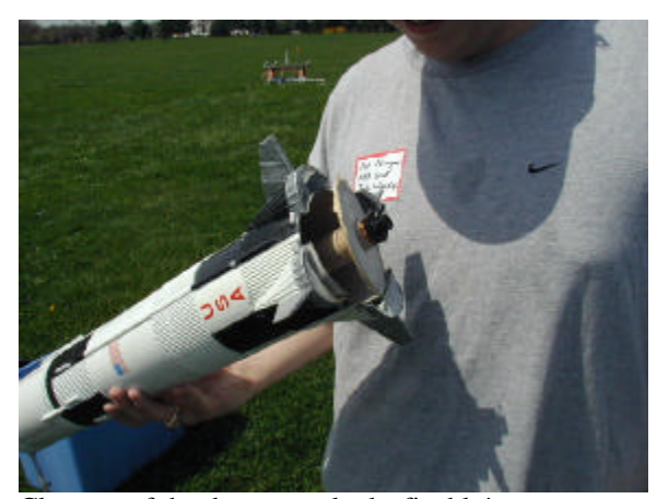
Close up of the damage... looks fixable!