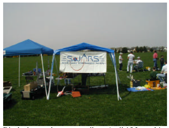
Displaying our banner proudly at April 15 Launch!