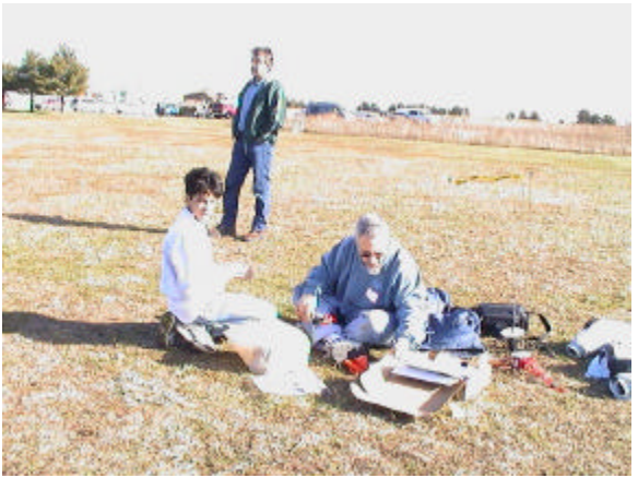
Field repair of shock cord shred.