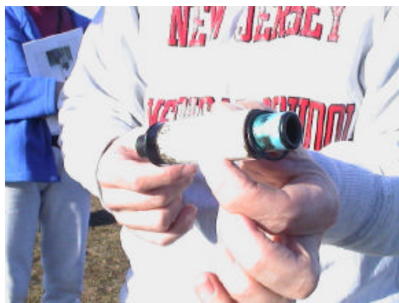
Reload removed intact from its casing, demonstrating the "anatomy" of an RMS motor.