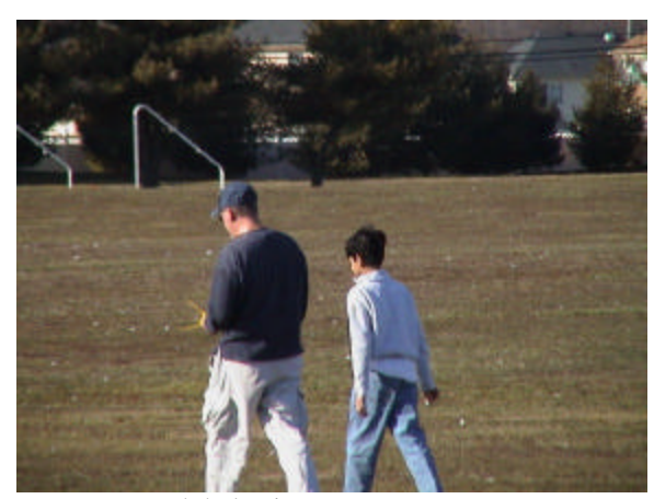
Teamwork helps in recovery.